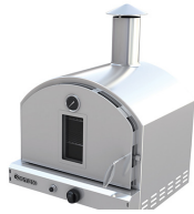
Gasmate Gas Pizza Oven