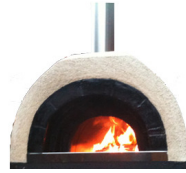
Bellissimo Wood Fired