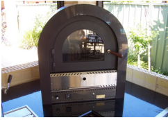
Infresco Gas Pizza Oven